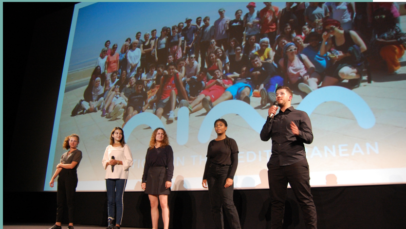
ISRAEL PALESTINE: FOR A BETTER UNDERSTANDING - YOUTH (IPPMC)