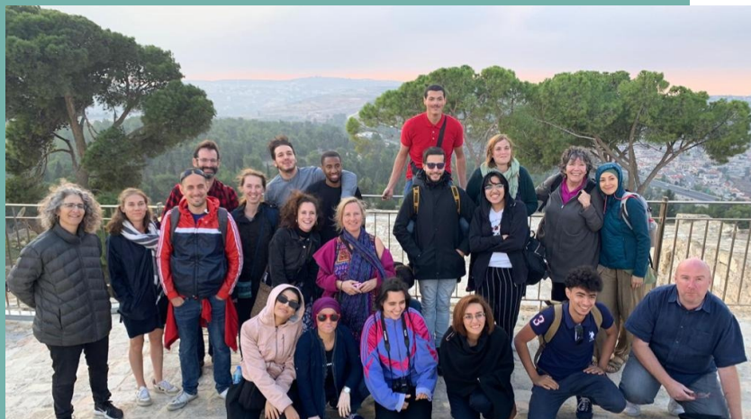
ISRAEL PALESTINE: FOR A BETTER UNDERSTANDING - ADULTS (IMPACT)