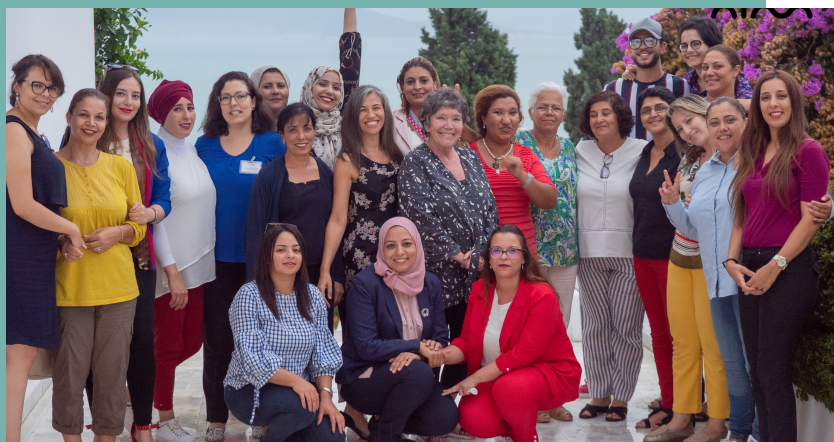
WOMEN LEADERS OF TOMORROW (FLD)